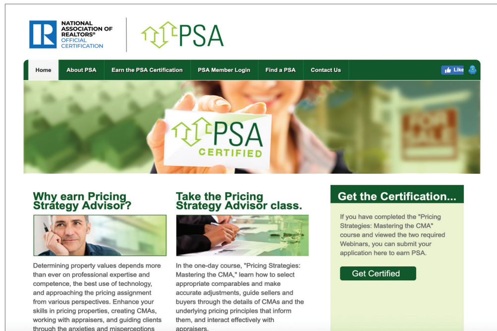
FIGURE A.1 PSA Certification Website

The Pricing Strategy Advisor is an official certification of the National Association of REALTORS®. The Certification is designed for real estate professionals at all experience levels whether working with buyers or sellers.